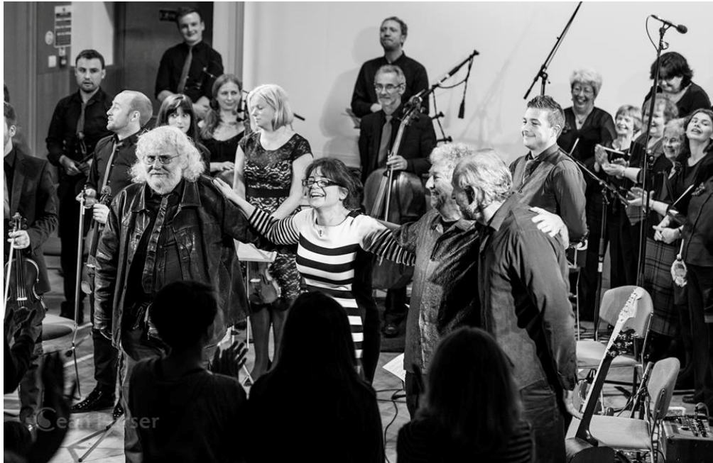
The Writing Crew