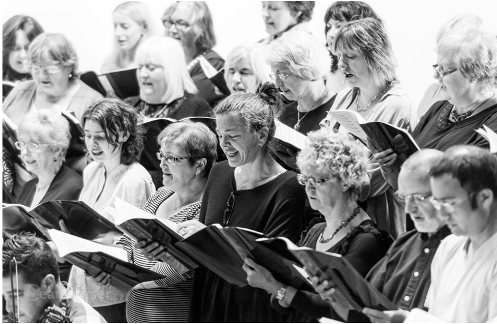
Inverness Gaelic Choir