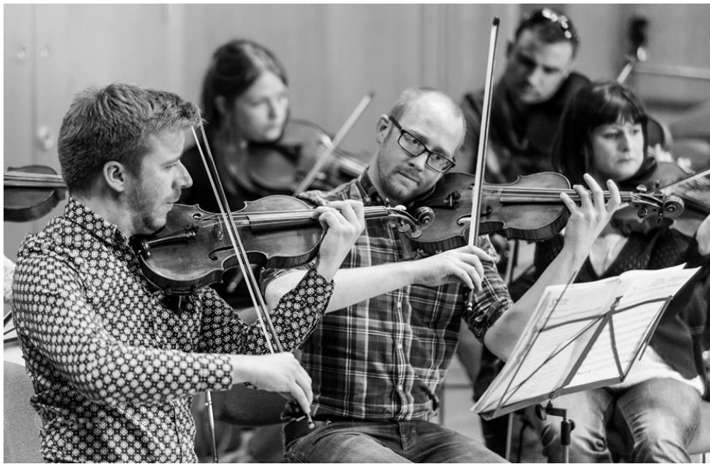
The Festival Strings