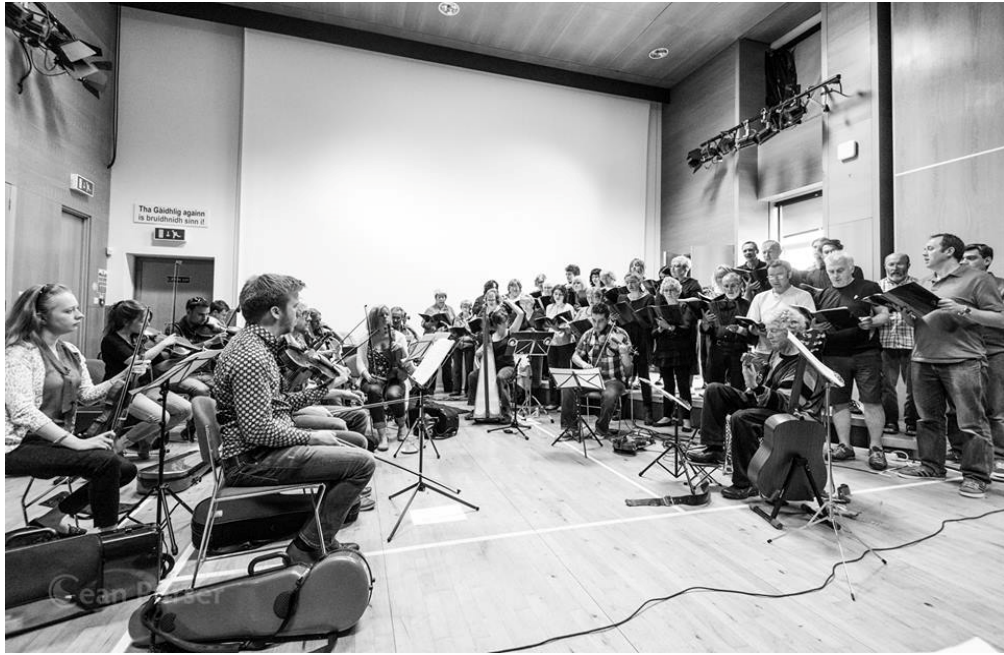
The Band and Choir Rehearsal